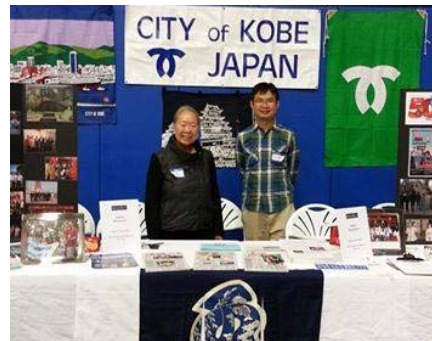
Amazing community members volunteering and helping host the SKSCA booth at Aki Matsuri