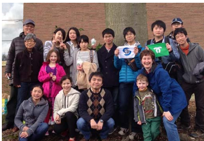
Kobe students with Seattle community members

The Kobe students continue to study English and think fondly of their time in Seattle!