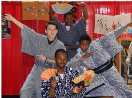
Students showing off their yukata at the Seattle Cherry Blossom & Japanese Cultural Festival

The festival is presented by Seattle Cherry Blossom and Japanese Cultural Festival Committee, which founded