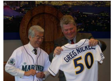
Mayors Yada and Nickels exchange baseball jerseys

Kobe City Mayor Tatsuo Yada led a delegation of 67 people from Kobe to celebrate our anniversaries from October 9-12, 2007. This delegation included representatives from the City of Kobe, Port of Kobe, Kobe City Council, Kobe Women's Group, Kobe Labor Unions, Kobe-Seattle Sister City Association, Foreign Language University and the Kobe City Philharmonic Chorus.