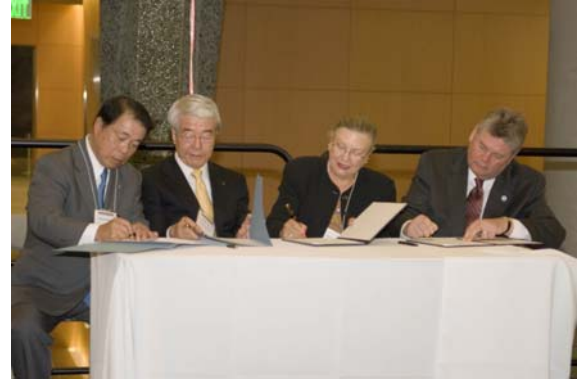
Kobe City Assembly Chair Maejima, Mayor Yada, Seattle City Councilmember Jan Drago and Mayor Nickels sign an agreement to continue our relationship for the next 50 years