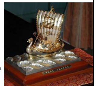
The Takarabune Regatta trophy

Since 1892, the Seattle Yacht Club has encouraged yachting and boating of all kinds and the development of the recreational marine advantages of the Pacific Northwest. Today, the club stages a variety of community activities ranging from youth sailing classes to navigation and sailing competitions to the annual Opening Day parade of boats down the Montlake Cut. Through an associated charitable foundation, the club's members provide financial support for activities that promote and educate the public in the knowledge and skills of boating, with an emphasis on supporting youth engaged in amateur competition.