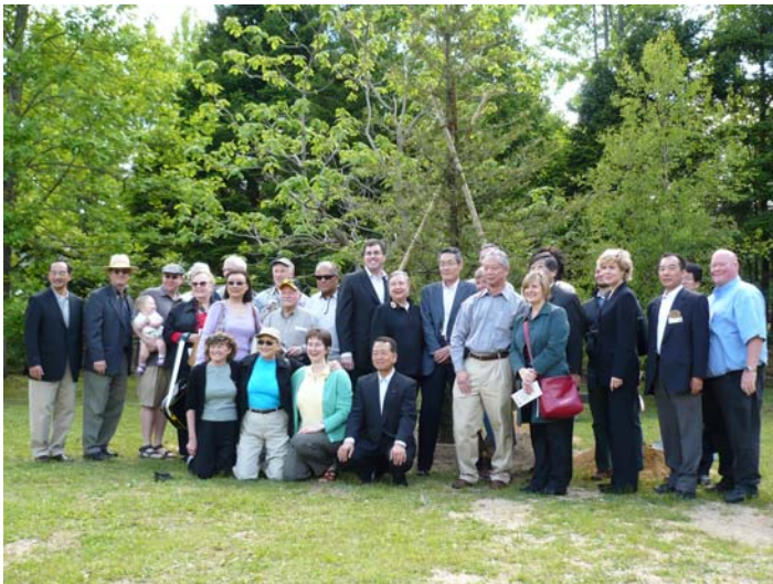
Group at tree planting at Seattle Forest in the Kobe Arboretum