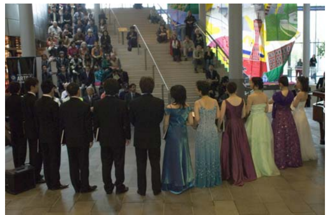
The Kobe Philharmonic Chorus performs at Seattle City Hall with the Big Kimono