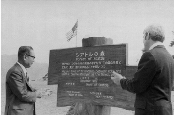
Mayor Miyazaki and Mayor Uhlman at Seattle Forest Dedication in 1975