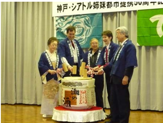
Below: Breaking the sake barrel at the reception at Sorakuen Garden