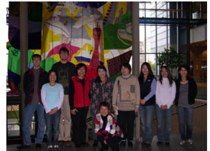
Volunteers after hanging the Big Kimono in City Hall