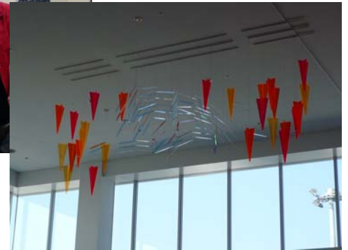
Below: Koryn Rolstad artwork at the Kobe Airport symbolizing sun rays and ocean waves