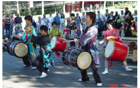
Hatakko Daiko attracts a crowd at Seattle Center.

which had a great earthquake, group members become engaged in the world they live in and are encouraged to think about issues of international peace.