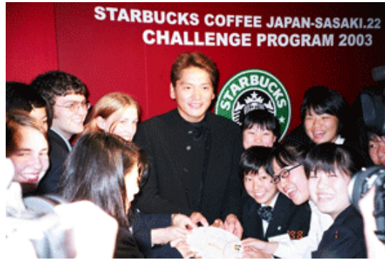
Seattle SEFAIR Ambassadors in Kobe during a press conference with Seattle Mariners pitcher Kazuhiro Sasaki and Starbucks International.