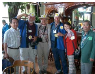
Washington and Hyogo citizens ham it up at the Fig Fest event.

fecture and Japan as a whole. These events included business seminars, theatre performances, a friendship BBQ,