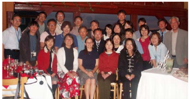
Some SKSCA members and staff of The Laurasian Institution joined these teachers for some Pacific Northwest cuisine catered by Bay Catering at Pier 57.

At the end of August, a group of K-12 teachers and professors of education from Hyogo Prefecture (mostly from Kobe), traveled to Seattle to learn more about Americans and the United States. According to their project descrip-