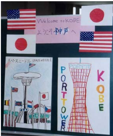
Posters made by students to welcome the Seattle delegation to Minato Elementary School to view their disaster-safe community efforts.