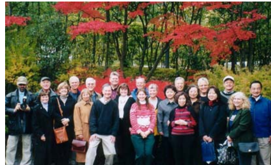
A group of the Seattle delegation enjoys the fall color in the Arima Hot Springs area of Kobe.

The delegation's main activities included: the opening of a one-month Seattle photo exhibit at Kobe City Hall to introduce Kobe citizens to Seattle; tours of several disaster preparedness centers and exhibits, in-