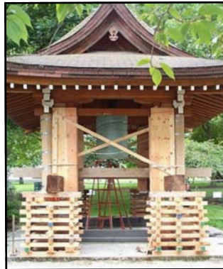
During renovation work on the Kobe Bell