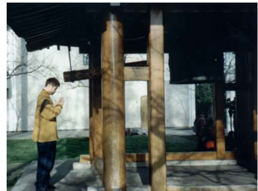
New Mariner Ichiro Suzuki offers a prayer during the Earthquake Memorial Ceremony.